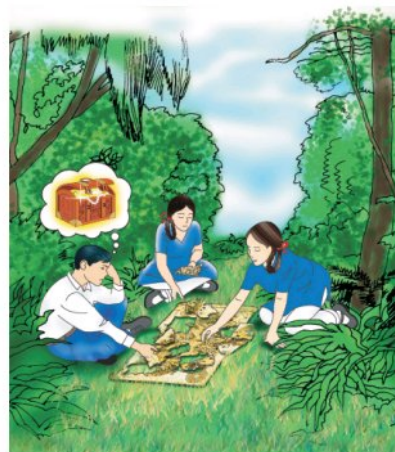
Figure 5.1 Imagine you and your friends have found pieces of an old map to reach a treasure. Would it be easy or chaotic to find the way to the treasure? Similar chaos was there in Chemistry as elements were known but there was no clue as to how to classify and study about them.

In the year 1817, Johann Wolfgang Döbereiner, a German chemist, tried to arrange the elements with similar properties into groups. He identified some groups having three elements each. So he called these groups 'triads'. Döbereiner showed that when the three elements in a